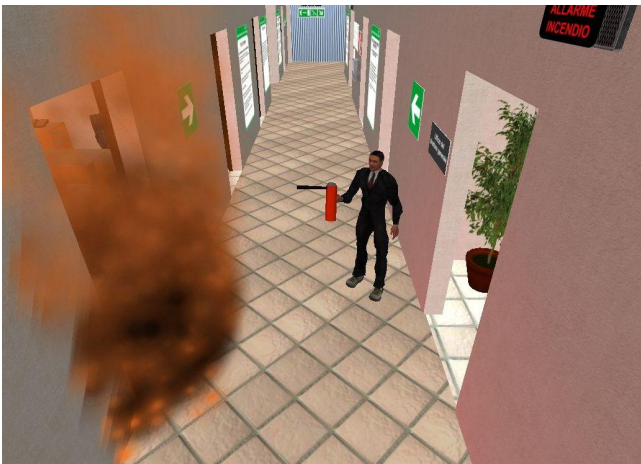
Figure 13 The fire extinguisher operator in action

Figure 12) on a wheelchair, and her/his role assumes primary importance to simulate discomfort and eventual movement difficulties, because of obvious factors such as fire, smoke, scarce visibility, other avatars' behaviour, etc. According to the law, at least a person responsible for the evacuation of disabled people must be present on the floor at all times, when the fire alarm starts, this person reaches the avatar on the wheelchair and brings her/him out in a safe place such as the external balcony, where they can wait together for rescue. Another safe place is the gathering place situated outside the building if the elevators are safe.