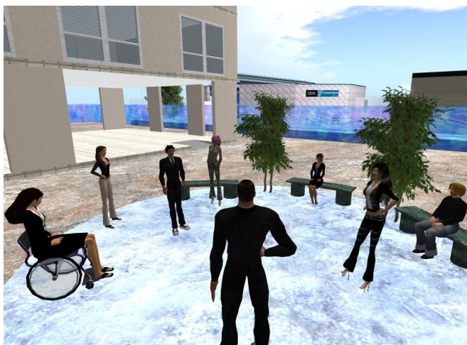
Figure 14 The rallying place, at the end of the experiment

Figure 14), they can discuss about the evacuation simulation just completed.