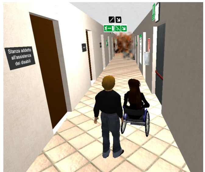
Figure 12 The avatar with a disability and the person responsible for her safety

In this section we briefly describe the roles that users can play during the evacuation simulation. There are mainly two kind of roles: playing characters (PC) and non-playing characters (NPC). PCs are the real users of the virtual building and, in a number usually between 5 and 10, are the participants of the evacuation simulation. The NPCs group was formed by a team of eight people that in turn assisted each simulation we ran. The PCs were casual people who were visiting our stand in a trade fair event (Forum PA held in Rome in 2008) and spontaneously decided to participate to the experiment. Each PC performed the simulation only once. The PCs seldom were experts of virtual worlds and in particular of Second Life. For this reason we designed and developed the whole project so that it could easily be accessible for users that don't have familiarity with new technologies.