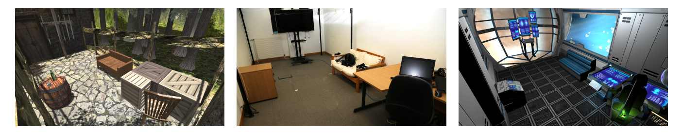
Figure 1: Two Substitutional Environments from our previous work [12] based on the same physical living room: a medieval courtyard (left) and the bridge of a spaceship (right).

GravitySpace [1] is a system that, by means of a pressuresensitive floor (which also acts as a display), is able to recreate a Virtual Environment based on what is happening above the floor. Using image-recognition techniques, the system analyses the contact points of furniture and people. Furniture are detected through their pressure and are uniquely identified by a rotation-invariant marker. Users are detected by matching their shoe footprint to a database of registered shoes. In this way the system is able to support various applications such as interactive games.